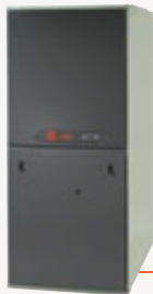
XV95 Furnace With Variable-Speed Motor and Comfort-R™

As part of our continuous product improvement, Trane reserves the right to change specifications and design without notice.